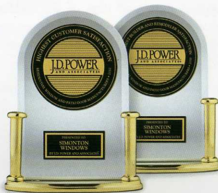
Highest in Customer Satisfaction and in Builder/Remodeler Satisfaction with Residential Window and Door Manufacturers

Simonton Windows achieves high scores in all factors measured in this study.